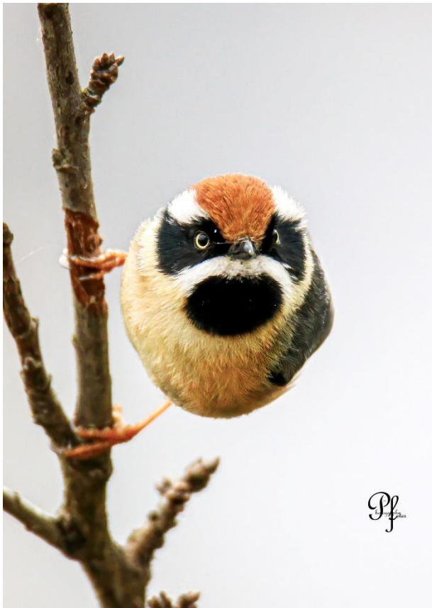
Black-throated Tit [Binaya Shrestha]

Where? Nepal is a beautiful country perched between the giant nations of India and China. The nation stretches from the plains of India through the foothills to the peaks of the Himalayas proper; offering mountain scenery unmatched anywhere in the world. Here, in the mountains, Mount Everest, the world's highest peak, stands at nearly 9000 metres above sea level. High in these mountains people live as they have for centuries; grazing their animals, growing their crops and practising their Buddhist faith. In the foothills but still at a serious elevation as far as Australians are concerned are sprawling cities that maintain their history through a variety of temples, stupas and statues. The lowlands, in contrast, are home to people, more Indian in appearance and culture, who practise the ancient faith of Hinduism. These lowlands host many great National Parks, including Chitwan – home to Tigers, Great Indian Rhinos, Sloth Bears and over 400 species of birds.