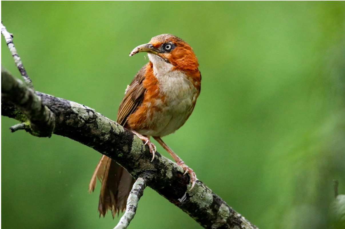
Rusty-cheeked Scimitar-Babbler [Binaya Shrestha]

Lower down the hill we hope to encounter such species as Maroon Oriole, White-bellied Drongo, Yellow-bellied Fantail, Red-rumped Swallow, Green-backed Tit, Gray-hooded Warbler, White-browed Fulvetta, White-crested Laughingthrush, Verditer Flycatcher, Blue Whistling-Thrush, Golden Bush-Robin, Blue-fronted Redstart, and Fire-breasted Flowerpecker. O/n Kathmandu Garden Home or similar. B , L , D