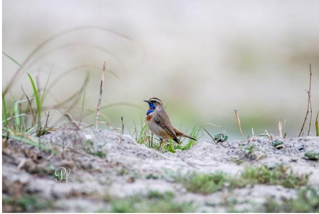
Bluethroat [Binaya Shrestha]