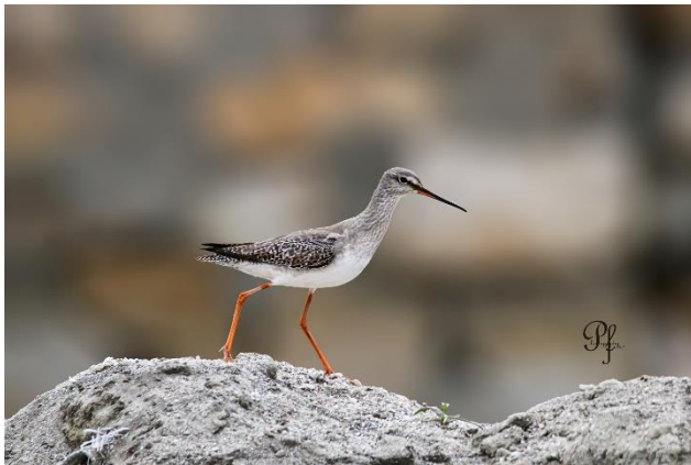
Spotted Redshank

We will enjoy two full days exploring the grasslands and wetlands of Koshi. Birds which can be seen at Koshi Tappu include Sarus Crane, Indian Skimmer, Ruddy Shelduck, Yellow-eyed Babbler, White-tailed Stonechat, Black-necked Stork, Swamp Francolin, Baer's Pochard, Pallas's Fish Eagle, Striated Marsh Warbler, Black-bellied Tern, Pied and Marsh Harriers, Great and Little Cormorants. Raptors to look out for include the Brown Fish-Owl,