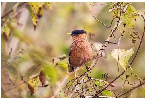
Brahminy Starling [Binaya Shrestha]

Lower down the hill we hope to encounter such species as Maroon Oriole, White-bellied Drongo, Yellow-bellied Fantail, Red-rumped Swallow, Green-backed Tit, Gray-hooded Warbler, White-browed Fulvetta, White-crested Laughingthrush, Verditer Flycatcher, Blue Whistling-Thrush, Golden Bush-Robin, Blue-fronted Redstart, and Fire-breasted Flowerpecker. O/n Kathmandu Garden Home or similar. B , L , D