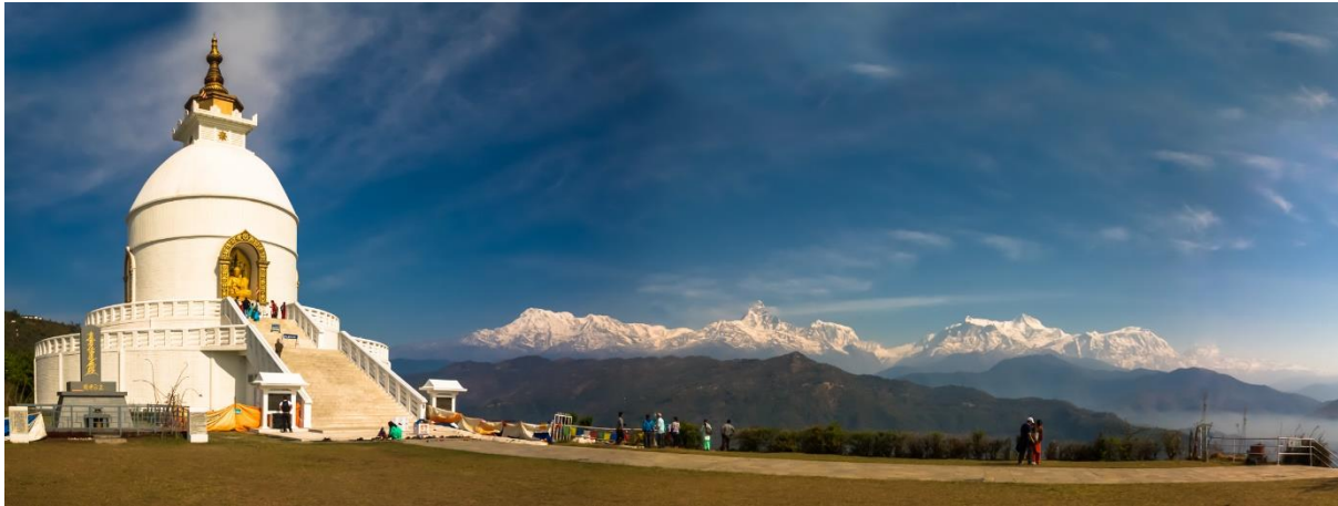
World Peace Pagoda above Pokhara