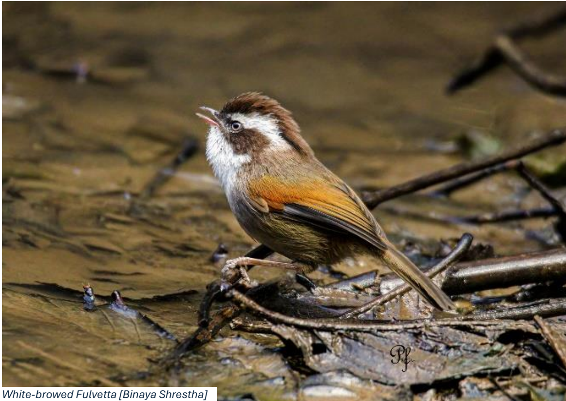
White-browed Fulvetta [Binaya Shrestha]

major structures within it were added in later periods.