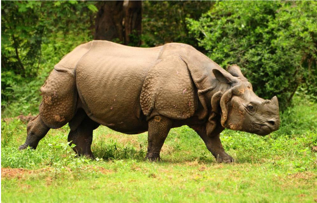
Great Indian one-horned Rhino

We will try to explore this ecosystem in a variety of ways: via boats, jeep and on foot Great Hornbill, Indian Peacock, Kingfishers, Asian Paradise Flycatcher, Himalayan Griffon Vulture,