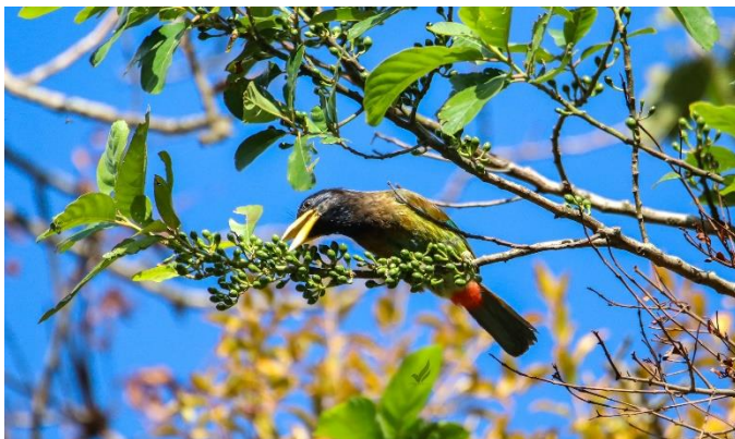
Great Barbet

House Swift, Black Kite, Great and Blue-throated Barbets, Alexandrine and Rose-ringed Parakeets, House Crow, Barn Swallow, Red-vented Bulbul, Common and Jungle Mynas, and Oriental Magpie Robin.