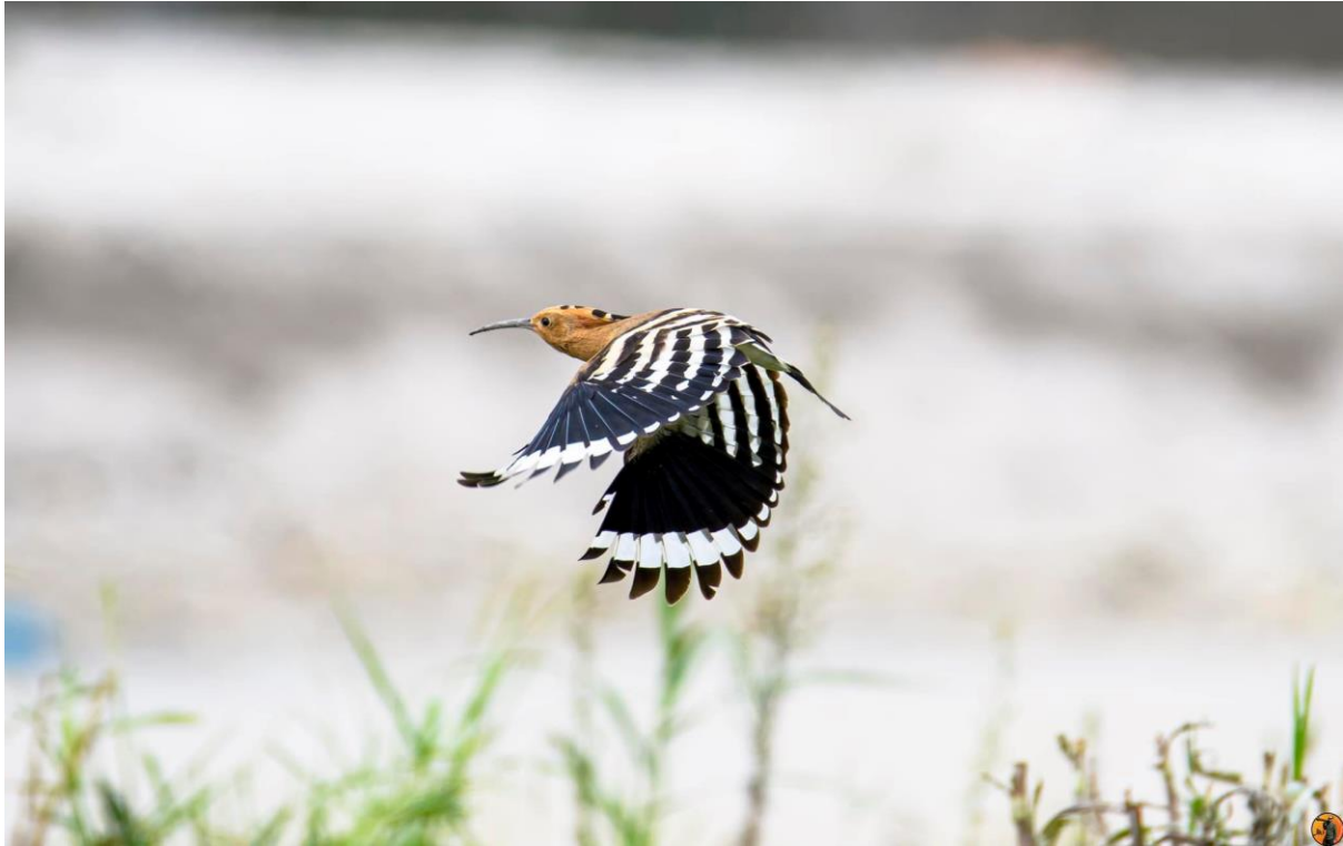
Hoopoe [Supradeepra Neupane]

Today we drive from Pokhara, elevation 800 metres above sea level, to Chitwan National Park, elevation approximately 100 metres above sea level. The drive is scenic and takes about five hours.